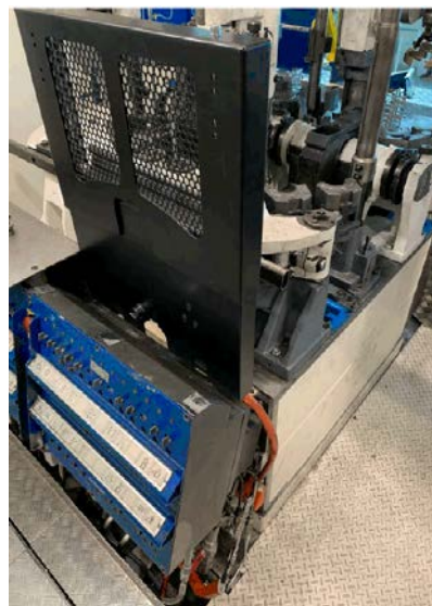
IS large and small frame