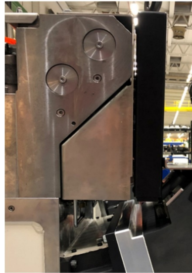
AIS +65mm and AIS 2 EPVB spacer