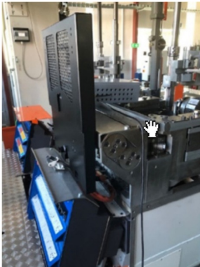
AIS with conventional Blank Bracket